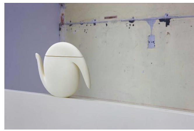
Aldo Bakker, Pot, 2015.

Adults: \in 12- / Groups of 10 or more: \in 9,- / Young people from 13-18 years, students / Eindhoven city pass (stadspas) holders: \in 6,- / Museumkaart, children under 13 years of age: free of charge. / Family pass (2 adults and max. 3 children until 18 years): \in 18,-.