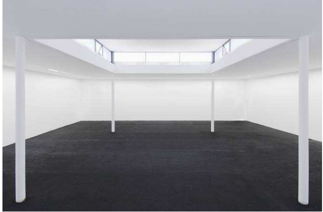
Ahmet Öğüt, Ground Control, Installation view at Kunst-Werke, 5th Berlin Biennial

Ahmet Öğüt was born in in Diyarbakir, Turkey in 1981 and studied at the Hacettepe University en the Yildiz Technical University. From 2007 to 2008 he studied at the Rijksacademie in Amsterdam. His work has been included all over the world including the biennales of Venice (2009), Berlin (2008), Santa Fe (2008), Thessaloniki (2007) and Istanbul (2005). His practice captures the imagination in unique ways, tackling complex political and economic themes with a lightness of touch. For example, in 2008 he presented Ground Control at the Berlin Biennale, where he covered the whole of the ground floor of the Kunst-Werke with asphalt. In Turkey, asphalt laying was a means of homogenizing the country in its rapid quest to modernize, metaphorically covering over some of its diverse history in the process. Recalling conceptual practices of the 1960s the work also critiques the institutions and its potential to flatten ideas, concepts or histories. Ground Control will be recreated in the final room of Forward!.