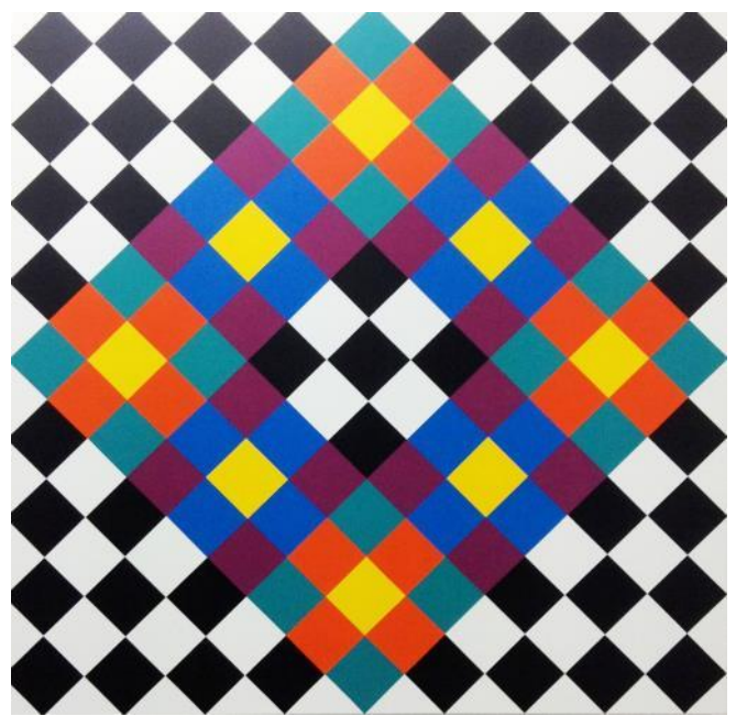
Rasheed Araeen, Opus F 3, 2014, courtesy the artist

The final room of the exhibition includes a version of Araeen's Zero to Infinity (1968-2017) consisting of sixty four cubes for visitors to rearrange. Surrounding this is a series of geometric paintings from his recent Homecoming and Opus Series (2014-ongoing) as well as two new lattice reliefs.